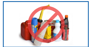
Containers that held hazardous products

Find disposal options for these items and many more on the Green Disposal Guide at hennepin.us/green-disposal-guide