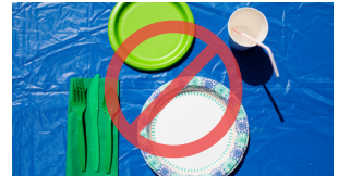
Paper plates, cups, napkins, straws, and utensils