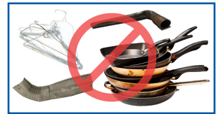
Random metal items