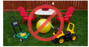
Large plastic items and toys